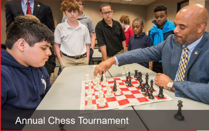
Annual Chess Tournament